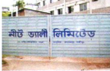
Factory Main gate